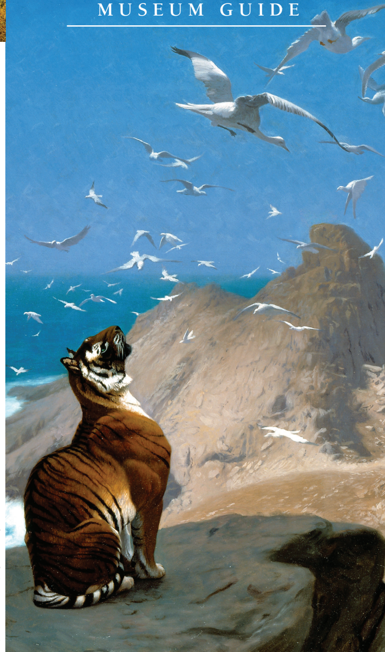
Cover: Jean-Leon Gerome (French, 1824 – 1904), Tiger Observing Cranes, c. 1890. Oil on Canvas and Panel, 32 x 25 1/4 inches. National Museum of Wildlife Art Collection.